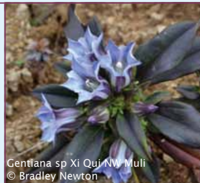
Gentiana sp Xi Qui NW Muli